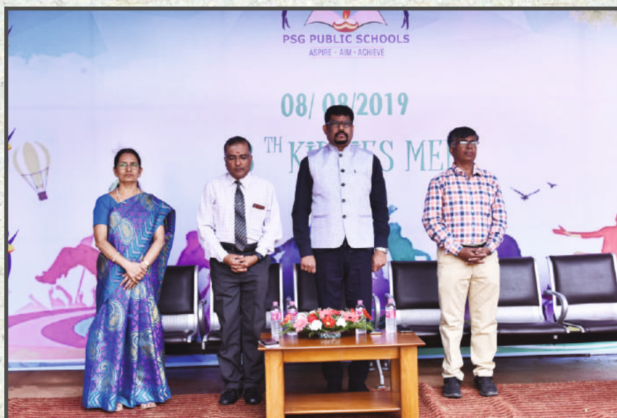
Kiddies Meet - 2019