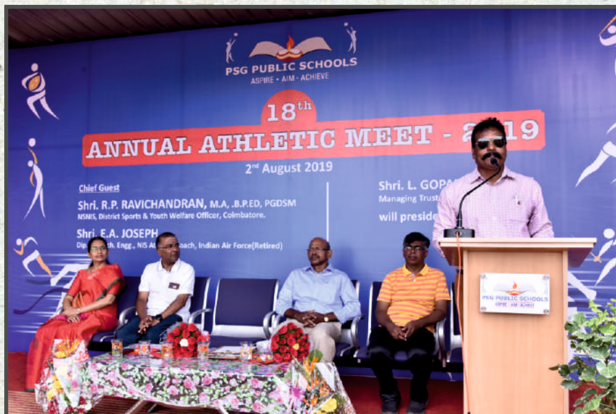
Annual Athletic Meet - 2019